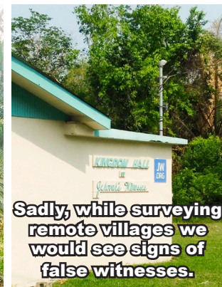
Sadly, while surveying remote villages we would see signs of false witnesses.

Contact information: PO Box 231 • Orange Walk Town, Belize C.A. • 011-501-632-3541 • Harris4Belize@yahoo.com