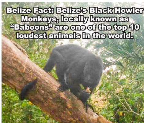
Belize Fact: Belize's Black Howler Monkeys, locally known as "Baboons" are one of the top 10 loudest animals in the world!